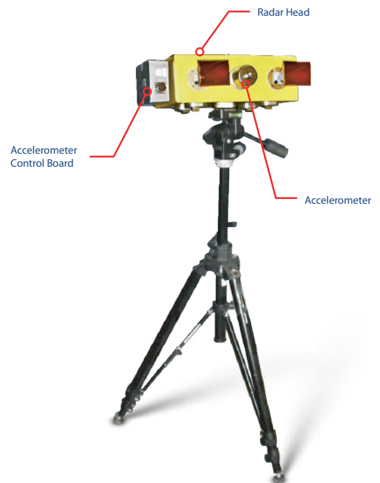
IBIS-FS Plus Incorporates an Accelerometer

Fig. 2: Shows the effect of the above subtraction procedure on the resulting displacement of the target. Spurious displacements induced by soil vibrations are cancelled.